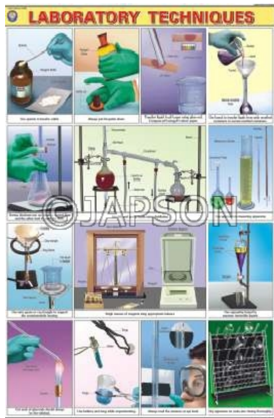
A. Charts, Laboratory Techniques