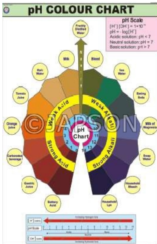
B. Charts, pH Colour Chart