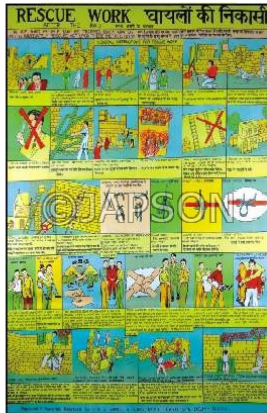
G. Charts, Your Duties - During War